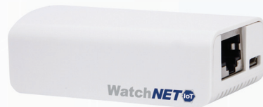
Mini Intelligent Gateway